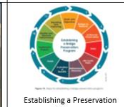
Establishing a Preservation Program Bridge Preservation Activities