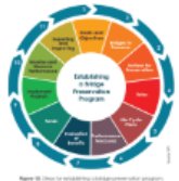
Establishing a Preservation Program Bridge Preservation Activities