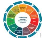
Establishing a Preservation Program Bridge Preservation Activities